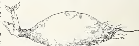
A Single Dahlia bulb showing the appearance of a healthy tuber

Pompon —Having same characteristics as Ball dahlias, but less than two inches in diameter. For example, Belle of Springfield, Nerissa.